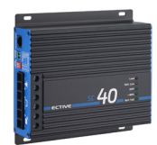
SC 40 bei 24-V-Batterien