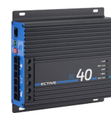
SC 40 bei 24-V-Batterien